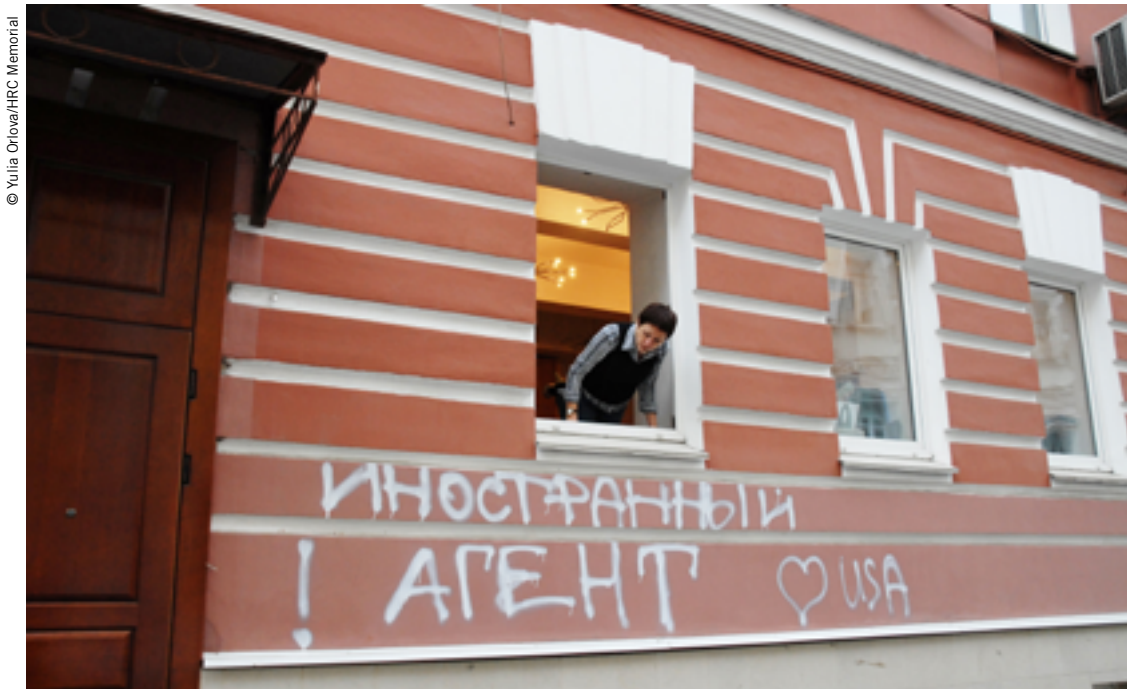
Graffiti reading “Foreign agent. Love USA” on the building of the NGO Memorial in Russia’s capital, Moscow [2012]

In Russia , civil society organizations that criticize, or do not conform with, government positions are starved of state funding, while considerable resources are channelled into social service providers who, while providing valuable services, are not engaged in publicly demanding rights or accountability. Groups