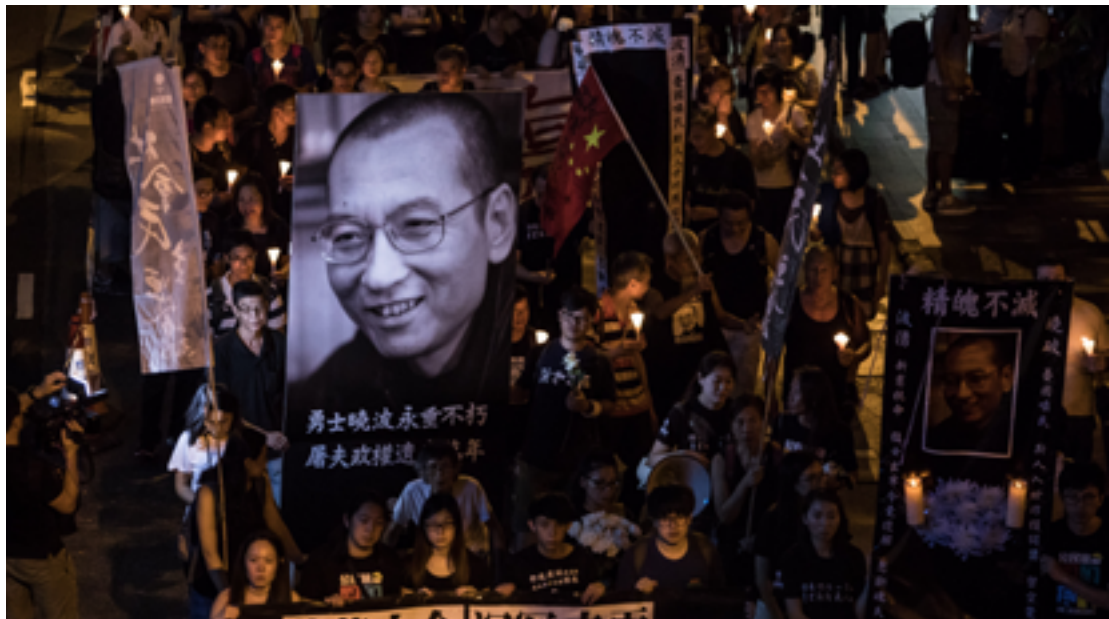
People attend a candlelight march for the late Chinese Nobel Peace Prize laureate Liu Xiaobo in Hong Kong. [2017]